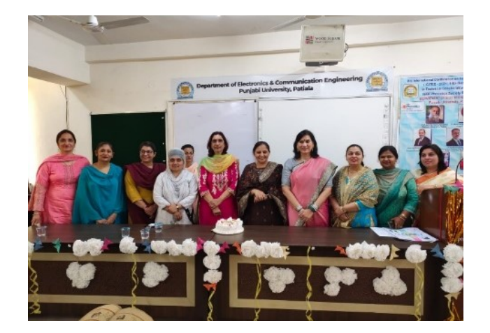
Women's Day celebrations