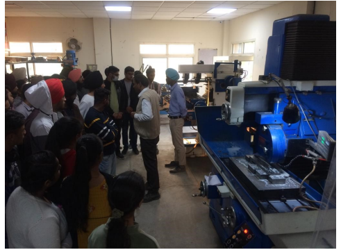
Visit to NSIC Technical Service Centre, Rajpura.