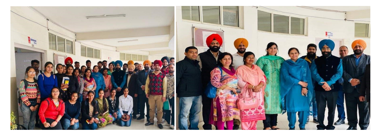
Engineering Day Celebrations