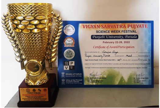
\mathbf{1}^{\text{ST}} Position in Science Week Competition