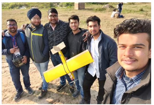
1^{\mbox{\scriptsize st}} Position in Aero-Modeling Competition