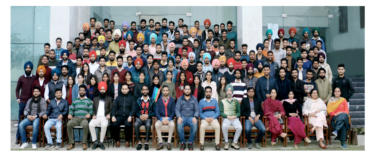
Department of Civil Engineering