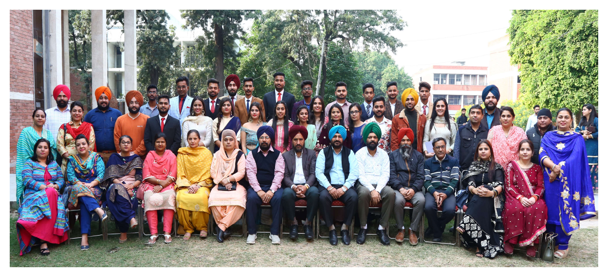
Department of Electronics and Communication Engineering