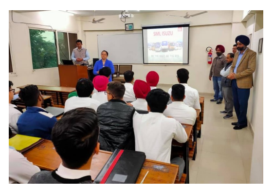
Session by delegates from SML Isuzu Ltd.