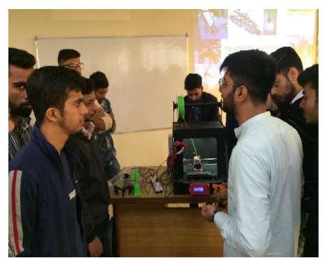
Workshop on 3D Printing