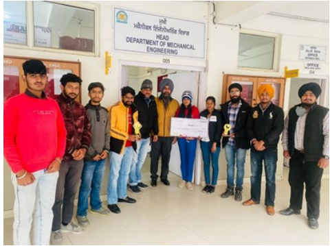
Future Award - Indian Karting Race (Season 6)