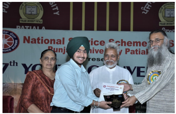
Best NSS Volunteer Award

Participation in Science Week Celebrations.