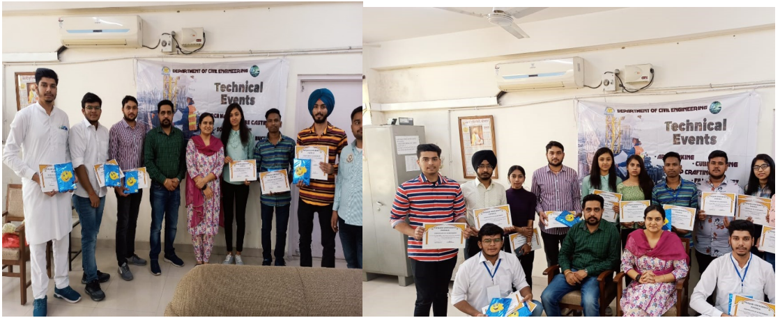
Technical Events (Cube making and quiz competition)